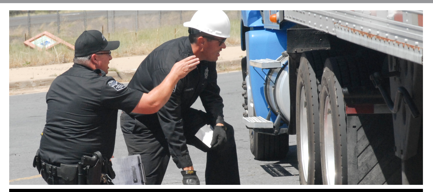
Two AZ DPS Commercial Vehicle Enforcement Troopers conducting a commercial vehicle inspection.