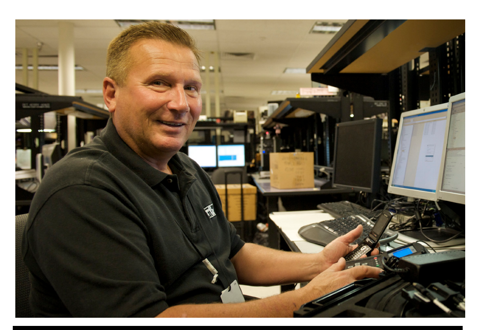
One of the full-time computer forensics examiners assigned to the AZ DPS-hosted Computer Forensics Unit is shown above working a case involving electronic evidence. In today's world, nearly every crime involves the use of electronic evidence such as computers, smart phones, and global positioning systems.

The center provides proactive intelligence, investigative and technical support to law enforcement and other agencies critical to Arizona and the country's homeland-security efforts. The ACTIC Watch Center is