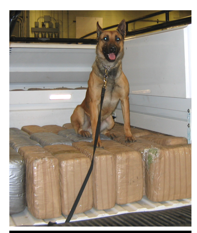
One of the Department's narcotics detection canines is shown above with a drug seizure he alerted on.

All canines are dual purpose trained (narcotics and patrol) and must go through ten weeks of rigorous training with their handler before they can become certified as a team.