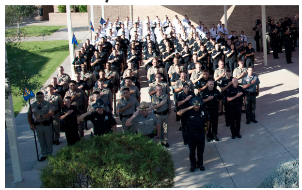
Police recruits at the Arizona Law Enforcement Training Academy (ALEA).

The Arizona Law Enforcement Academy (ALEA) is Arizona's largest police recruit training facility. Over 40 law enforcement agencies utilize ALEA to train their police recruits. The academy is overseen by the Department of Public Safety, the Phoenix Police Department and the Arizona Peace Officers Standards and Training (AZPOST) Board. Police officer hiring has increased in Arizona and as a result ALEA graduated 148 certified police officers in FY 2015. The overall attrition rate at the academy was 13.5% for all recruits.