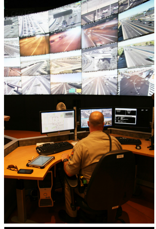
An AZ DPS Trooper can be seen above working at the State's Traffic Operations Center (TOC) in Phoenix. The AZ DPS Wireless Systems Bureau helped install a radio dispatch console for troopers to use at the center.

The software greatly assists with tracking life-cycle costs, location history, repair part availability, and other critical metrics specific to telecommunications essential to operating an efficient communications infrastructure. Looking to further support the state's direction of consolidation of efforts between agencies, WSB hopes that this tool proves an invaluable asset in the effort to support the upgrade of our state's communication assets, for the benefit of all of its users.