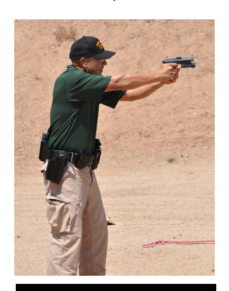
Firearms instruction is just one of the various training disciplines offered by the Operational Training Section at AZ DPS.

In January of 2015, the Department's Firearms Training Unit