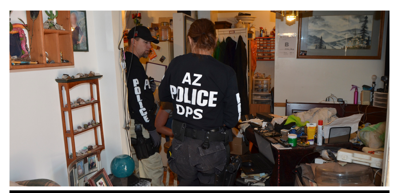
Two members of the Criminal Investigations Division during the service of a search warrant.

he Criminal Investigations Division (CID) is committed to providing the highest quality investigative and specialized response services to the public and the criminal justice community. The Division is guided by three immutable values: honor, courage, and commitment, while fostering a supportive and empowered environment for its employees.