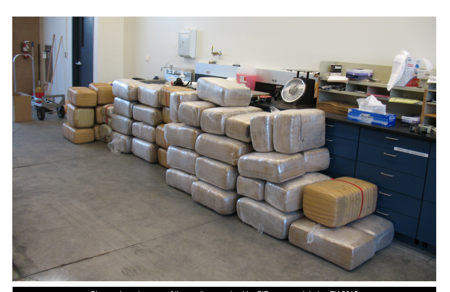
Shown above is some of the marijuana seized by CID personnel during FY 2015