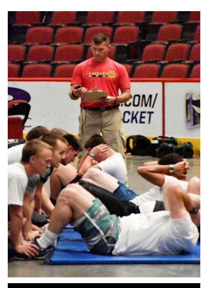
Applicants for trooper positions during the physical fitness portion of the agency's hiring process.

The Human Resources Section is also responsible for hiring professional staff employees who are critical to the support of the department. In FY 2015, Human Resources was able to replace 87 departing employees. In alignment with Governor Ducey's LEAN transformation initiative, Human Resources began actively reviewing all processes related to sworn hiring from recruitment to final hiring.