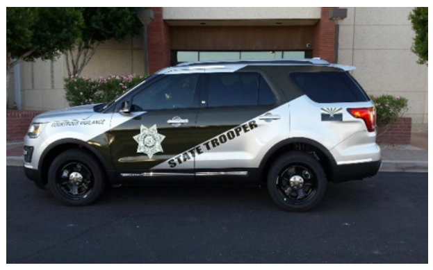
In furtherance of Director Milstead's vision to rebrand the department, Fleet created prototypes, including the one pictured here, with new graphic designs to gauge employee and public response.

The Logistics Bureau is responsible for planning, managing and controlling the flow of goods and services to the department. This bureau consists of the following sections: Support Services, Procurement, Security, Fleet Services, and Facilities. Fleet Services is responsible for maintaining the department's fleet of extreme-use vehicles and has shops located in Phoenix, Flagstaff, and Tucson. The Fleet Section procures new vehicles and takes them through the build-up process to make them fully functioning operational vehicles for Highway Patrol,