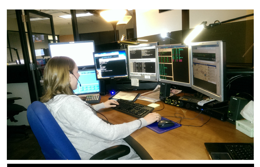
A dispatcher assigned to the Operational Communications Bureau dispatching calls for service to troopers.

The Operational Communications Bureau consists of over 100 employees in three communications