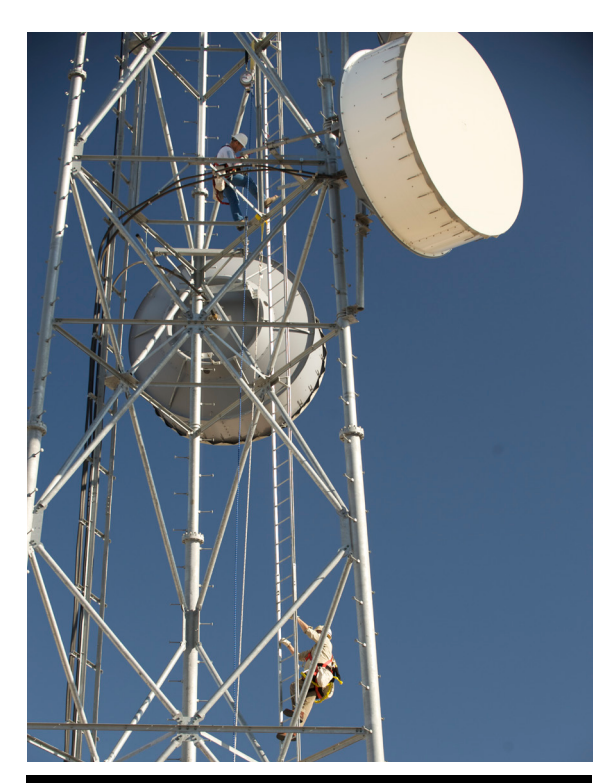
Wireless Systems Bureau employees performing maintenance on one of AZ DPS's communications towers.

The bureau also made substantial progress during FY 2015 by opening a new subscriber support facility in Phoenix. This new facility was opened in an effort to centralize